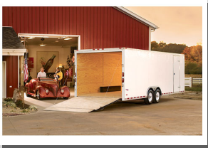
Race car and automobile transporters are a Pace specialty.