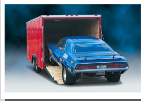
Pace's reputation for quality and a smooth ride started over twenty years ago with auto hauling models.