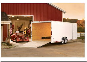
Race car and automobile transporters are a Pace specialty.